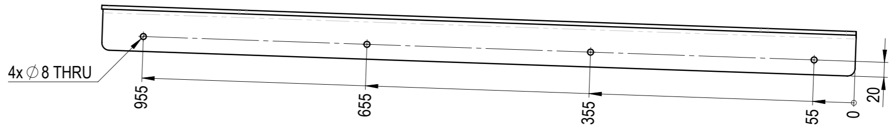
Flat Pattern view SCALE: 1:5